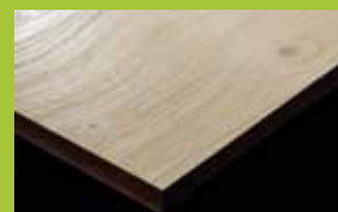
Bleached Knotty Pine