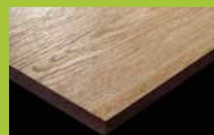
Oak Crown Cut